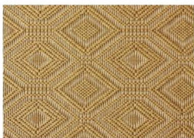
Style: Bali Color: Straw

Established in 1980 with their headquarters in Long Island, New York, Stanton Carpet Corporation has grown to be one of the top nation's manufacturers and importers of quality carpets and rugs.