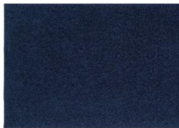
Style: OurSpace Bright Color: Midnight Navy Blue