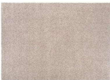
Style: Stony Creek Color: Beige/brown/white

Nance Industries originated in 1972 who now has the help of second and third generation family members. It is the largest woman owned flooring business in the United States!