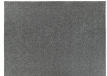
Style: Puresoft Shag Color: Dark Gray