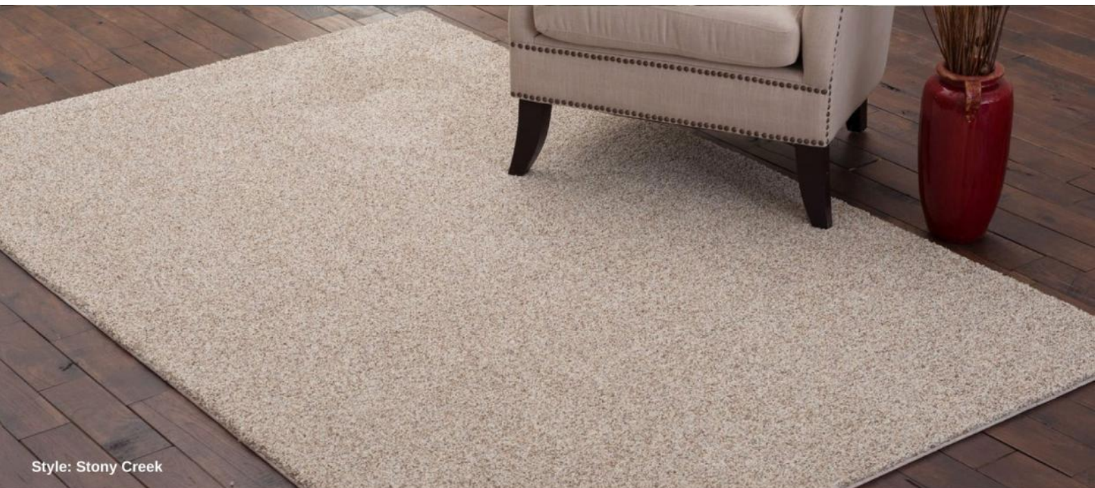
Style: Stony Creek