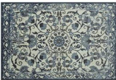
Style: BC29 Color: Ivory

Since 1979, Dalyn has created beautiful rugs and continue to offer trendy designed rugs of great value to this day.