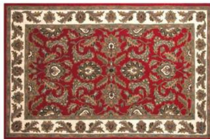
Style: JW10 Color: Red