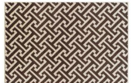
Style: MO998 Color: Choc