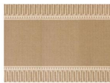
Style: Barrett Color: Dusk