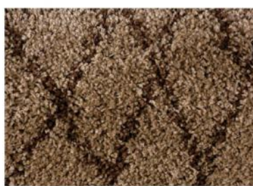
Style: Shaggy Kasbah Color: Buff